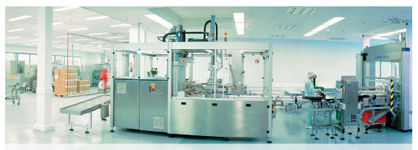
Pfizer Freiburg, Germany Special cleanroom supply air diffuser for high air supply volume and low room-air velocity