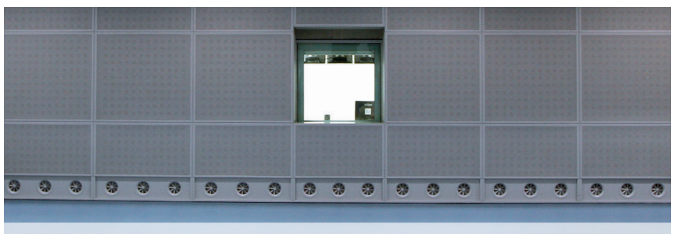
Indoor shooting range, Düsseldorf, Germany Guaranteed protection of the shooter against harmful gases and respirable dusts